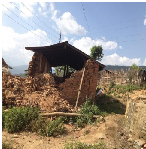
Many villages in Dolakha area completely destroyed

The village was reduced to ruins as was the health clinic.