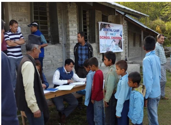
Children attending Marbu Dental Camp

TNT working with SITARA, Himsikhara Kathmandu Dental Teaching Hospital held a 4 day dental camp where 500 children received dental checks and treatment. Children, parents, teachers and health auxiliary staff also received hygiene and dental care education. It was a great success and free toothbrushes and toothpaste were given to every child.