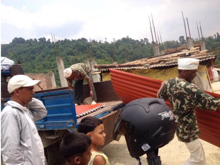
The Nestling Trust supply corrugated iron for bamboo houses prior to Monsoon season