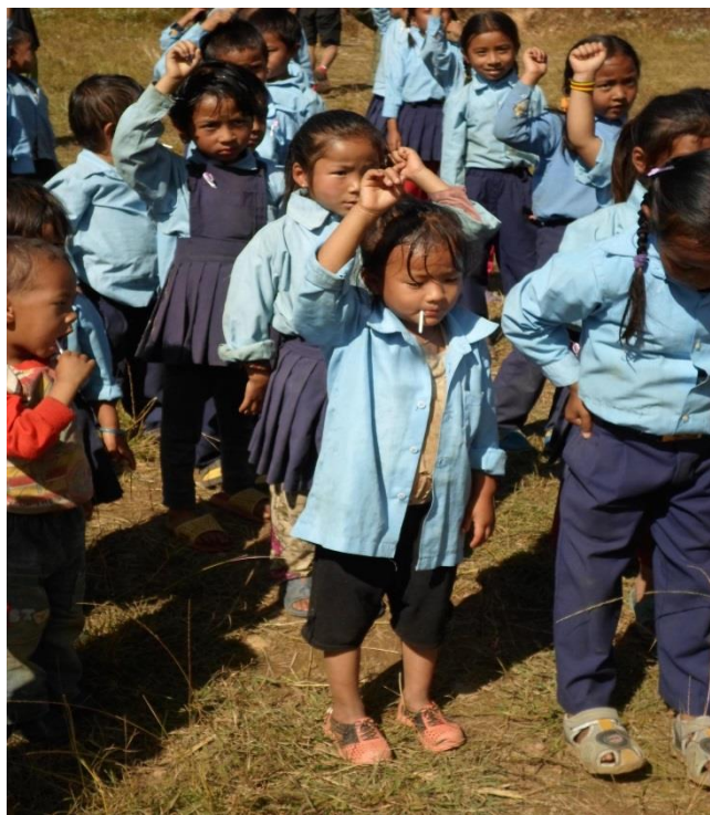
Fun Day for children from two poor families in Chitlang