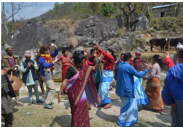
Celebrating the opening of Marbu Clinic