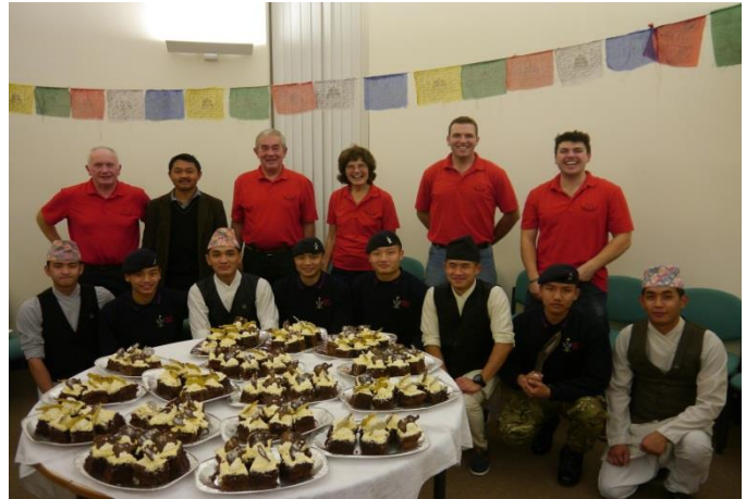
Nestling Trust Directors with soldiers from the Gurkha Regiment, Blandford

The response was overwhelming – a strong link has been formed between those living in poverty in Nepal and our own community in Wiltshire.