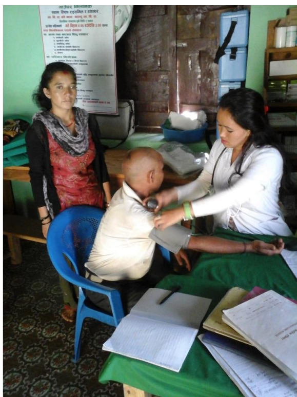
Young boy receives treatment at Marbu clinic