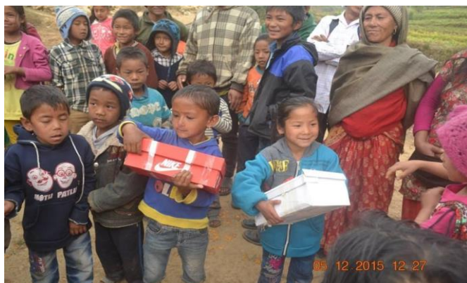
Children from Chitlang receive shoe boxes packed with gifts from UK children

Distribution of donated items from pharmacies, surgeries and individuals – transported from the UK courtesy of Etihad airways and TNT, to health clinics and Kantipur Teaching Hospital. Items also included children's clothes and shoeboxes filled with children's stationery and toys given by primary school children given to children of destitute families.