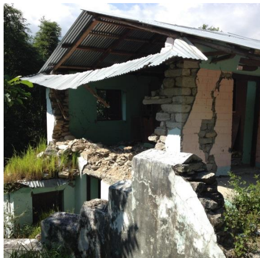
Marbu Clinic now in ruins